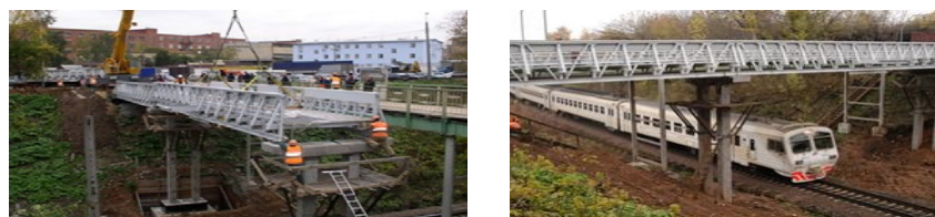
Fig. 2. Fiberglass bridge near the railway station Chertanovo, Moscow

The first fiberglass bridge in Russia (fig. 2) is located on the South of Moscow near the railway station Chertanovo (2004). The bridge consists of 3 spans that are installed on the four pillars. Its length is 41.1 m, width - 3 m. The assembly of each flight took 10 days, and the installation of the whole structure on a site - less than a day.