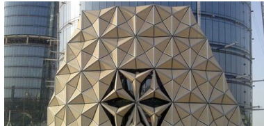
Fig. 7. Al Bahr towers

the object's dimensions [5]. Present digital design techniques, like parametric modeling, or building information modeling - BIM enable optimization and parametric control of the structural design.