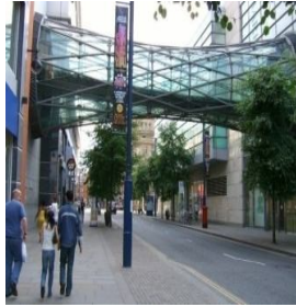
Fig.2. Hyperboloid bridge in Manchester