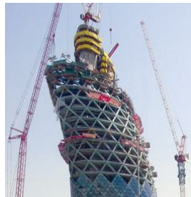
Fig. 4. Capital gate in Abu Dhabi

Earthquake architecture become challenging for the towns with seismic areas. One of the adopted concepts is of seismic insulation (object's reliance on series of flexible seismic insulators or dampers) [4]. K. Moon studied diagrid optimization on very tall buildings, concerning angle of diagrid with respect to