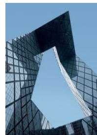
Fig.6. CCTV in Beijing