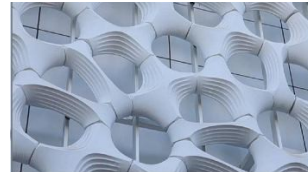
Fig. 8. Mexico City's hospital

In order to achieve creativity in direction of energy efficiency and ecology, regarding insulation and air streaming, some amazing facade tessellation elements (inspired by tradition - mashrabiyas) were designed on high Abu Dhabi tower, where traditional mud, clay and wood were replaced with the "smart"- dynamic facade solution (fig.7). The air purification process in Mexico City's hospital upholds ornate "double skin" with carbon air filters (fig.8).