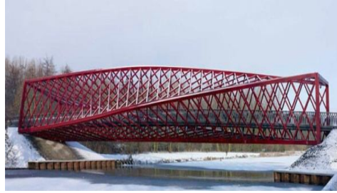
Fig.3. Horizontal "twisted" bridge in Netherlands

On the other hand, resisting even the gravitation laws diagrid overcame the vertical eccentricity of the objects (fig.5). In order to obtain rigidity of the stucture "Ring beams at the floor edges are normally tied into the diagrid to integrate the structural action into a coherent tube and connect the same to the floors, and back to the core" [1]. Hence the geometric shape of the building became artistically almost free of limitations. Although the seismic rules prefer simpler shapes, due to structural stability, likewise symmetry and uniformity, the present projects of architectural buildings are often struggling against it [4].