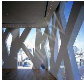
Fig. 5. Tod's building in Tokyo