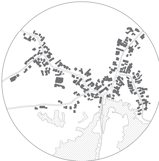
Fig. 3. Example of roadside village settlement (Рис. 3. Пример придорожного сельского поселения)

In recent decades, due to catalyzation of unplanned city expansion, slums appeared as a special type of urban-rural settlement [Fig. 4]. First origins of such settlements are linked with the Yugoslav post-war reconstruction of the 1950's and rural — urban migrations from that period. Nevertheless, their ultimate expansion took place during