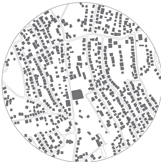
Fig. 4. Example of shantytown: Kaludjerica, Belgrade suburb, Serbia (Рис. 4. Пример самовольно построенного поселения: Калуджерица, пригород Белграда, Сербия)

the 1990s, when the socio-political changes in the Balkan Peninsula caused huge migrations [2].