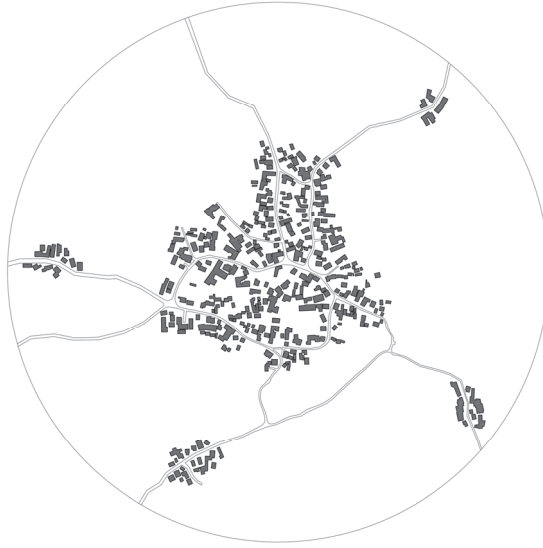
Fig. 2. Example of dispersed structure village settlement (Рис. 1. Пример поселения с разбитой морфологической структурой)

side of all households stretches all up to the road, lateral sides are touching each other, while the rear is usually output to agricultural land. The average population density is around 30—40 p/ha.